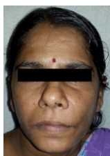
Figure 1. Extra-oral view showing swelling on the left middle third of the face.

Intra-oral examination revealed a diffuse swelling measuring approximately 2 X 2 cm on the buccal aspect of the alveolar ridge extending from the mesial aspect of the left maxillary canine up to the mesial aspect of first maxillary molar on the left side. Obliteration of the upper buccal sulcus was seen. A similar swelling was noticed on the palate extending up to the midline. The lesion was covered by normal appearing mucosa, was bony hard in consistency and non-tender. Hard tissue examination revealed several missing teeth and teeth that were grossly decayed. (Figure 2, Figure 3)