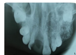
Figure 5. Maxillary occlusal radiograph showing mixed radiopaque-radiolucent lesion and expansion of the buccal cortical plate.