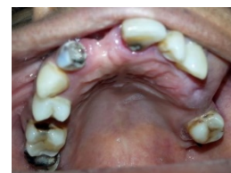
Figure 3. Intra-oral view showing swelling in the palatal side of the alveolus.

Intra-oral periapical radiograph of the left posterior maxilla showed increased radiopacity and trabeculation of the alveolar bone (Figure 4). Maxillary true occlusal radiograph showed increased trabecular density with a diffuse area of radiopacity and increased trabeculation extending from the left maxillary first molar up to the left central incisor. Expansion of the buccal cortical plate of the left maxilla was also evident (Figure 5). Panoramic radiography revealed diffuse radiopacity extending from the distal aspect of left maxillary central incisor up to the mesial aspect of left maxillary first molar with increased trabecular density. Radiopacity was noticed over the lower aspect of the left maxillary sinus (Figure 6). Based on the findings, a radiographic differential diagnosis of fibro-osseous lesion was considered and biopsy was advised.