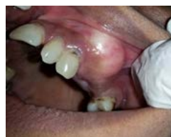
Figure 2. Intra-oral view showing swelling in the labial side of the alveolus.

Electric pulp vitality testing was done on all the teeth in the upper left quadrant and all teeth showed adequate response. Based on the history and clinical features, a provisional diagnosis of a fibro-osseous lesion was made. Differential diagnoses such as benign odontogenic tumor, ossifying fibroma and fibrous dysplasia were considered and radiographic examination was carried out.