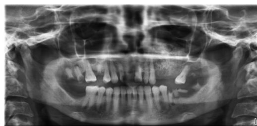
Figure 6. Orthopantomograph showing mixed radiopaque-radiolucent lesion.