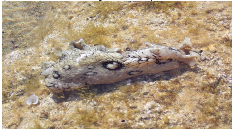
Figure 2. Aplysia dactylomela from Yeşilovacık Bay (35 cm length).

A specimen of spotted sea hare was seen in a rock pool which was covered with algae. It was first recorded from Yeşilovacık Bay in 2017 (Figure 2). The specimen of A. dactylomela were sighted in a rock pool at about 1 m deep and its length is 35 cm in the rock pool was covered with algae species. It was sighted the Padina pavonica from the brown algae in the rock pools.