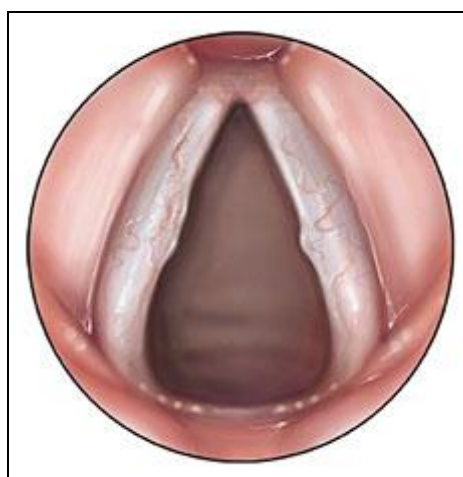
Vocal Cord Nodule