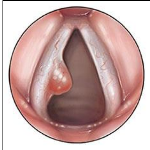
Vocal Cord Cyst

( http://my.clevelandclinic.org/services/head-neck/diseases-conditions/hic-vocal-cord-lesions )