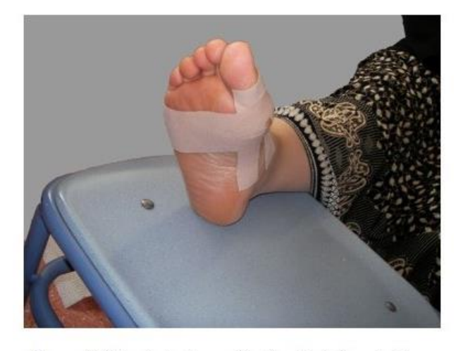
Figure 2. Kinesio-taping application for hallux rigidus

After the patient was informed about the taping procedure, KT was administered. Two Y-shaped kinesio-tape pieces were used. The first Yshaped strip's base was applied on the base of the big toe. After the big toe was aligned to its estimated correct position with a mild to moderate tension, the tape was applied through the first ray. This correction was done once during the application of the tape and took less than 10 seconds. No traction was used. The second tape piece was applied over metatarsophalangeal joints with a mechanical correction technique on the big toe (Figure 2) [8, 9]. After the tape was applied, the patient was kept in the clinic for 15 minutes for a risk of allergic reaction. In the meantime, exercises were explained to the patient. The tape was replaced every other three days. Before the tape was replaced, the taping area was examined for possible allergic reactions.