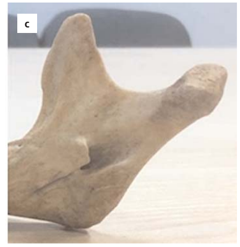
Figure 2. Different types of lingula; (a) triangular, (b) nodular, (c) truncated.