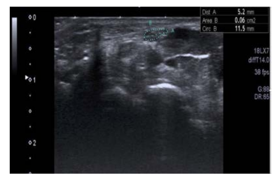
Figure 1. Distal measurement (entrance of the carpal tunnel): width and height (white), ss-sectional area (CSA) of the median nerve (green).

During the elastography process, the median nerve, which contains the areas of the healthy median nerve was observed in blue, while it displayed in red colour on the colour scale in case of increased hardness and fibrosis.