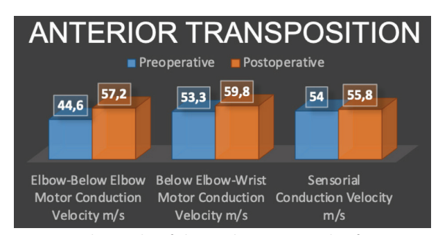
Figure 2: The results of electro diagnostic studies for anterior decompression. In the postoperative EMG results the 'elbow to below-elbow' and 'below-elbow to wrist' motor conduction velocity was increased significantly compared to preoperatively (p=0.018 and 0.04).