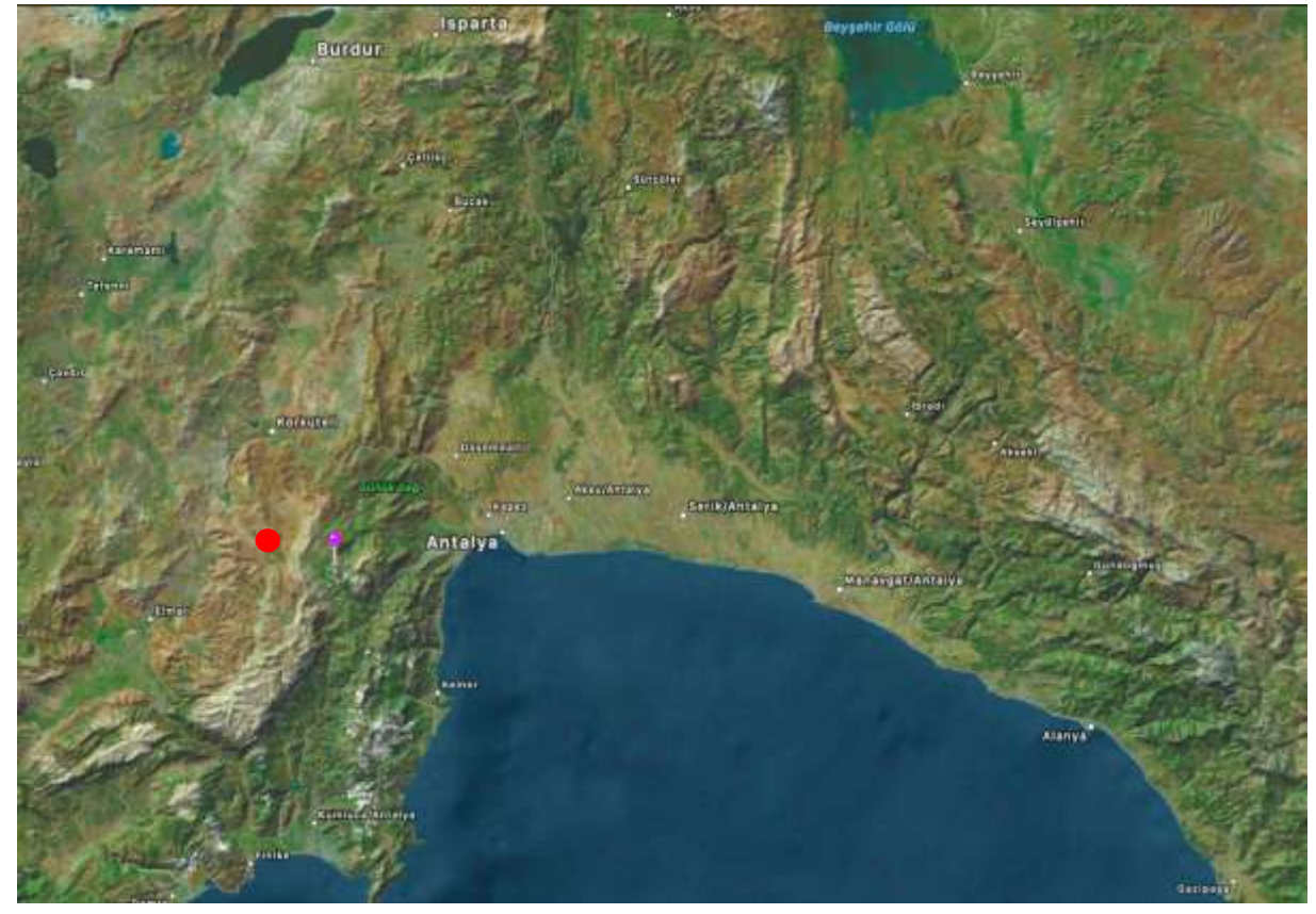
Figure 1. Location of beautiful vavilovia with red dot in Antalya, Turkey.