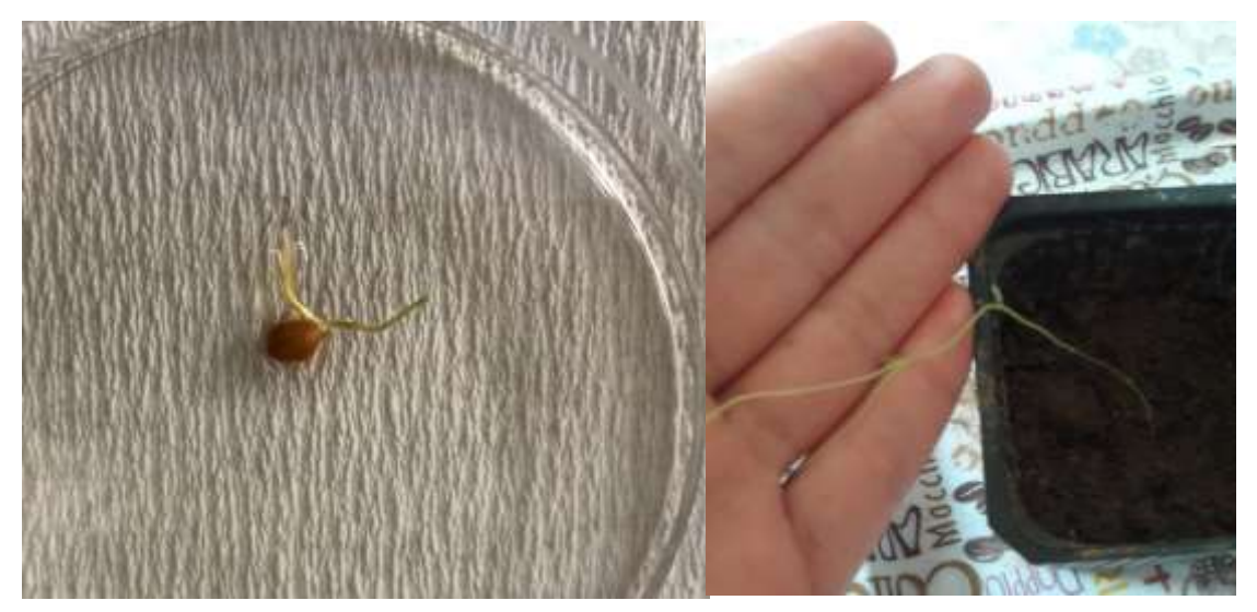
Figure 4. Radicle and plumule emergences in glycerol (1%) treatment in beautiful vavilovia.

Control treatment was the third rank after hydro-priming treatment with 21.7 days. As in the emergence of radicle, plumule emergence was the last rank at KCl treatment with a mean of 23 days (Figure 3). Radicle and plumule emergences were given in Figure 4.