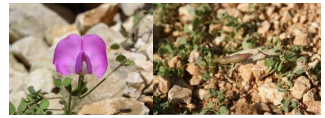
Figure 2. Flower and pod of beautiful vavilovia at Antalya location, Turkey.