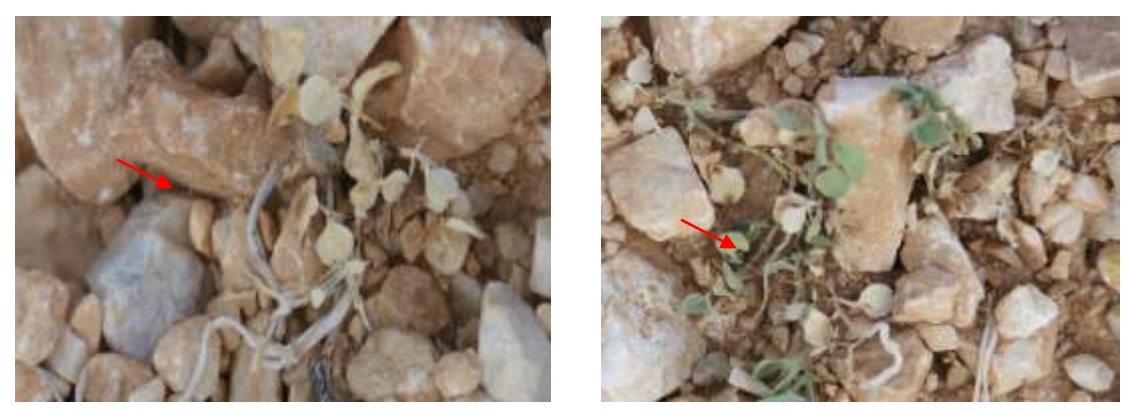
Figure 5. Relict beautiful vavilovia exposed to different biotic and abiotic in its habitat.

Results have shown that seed priming with glycerol significantly triggered germination of seeds of beautiful vavilovia. After glycerol, hydro-priming had almost similar to no-priming (control), while KCl treatment was stalled off germination in beautiful vavilovia that may be susceptibility salt. Priming with glycerol can be recommended because of not only the fastest but also the most reliable germination treatment in relict beautiful vavilovia. The germination and cultivation of beautiful vavilovia was considered to be an important bottleneck. It is essential to cultivate the relict beautiful vavilova in order to get the maximum benefit since inter-generic crosses between Vavilovia and Pisum deserve attention to improve novel traits in pea breeding.