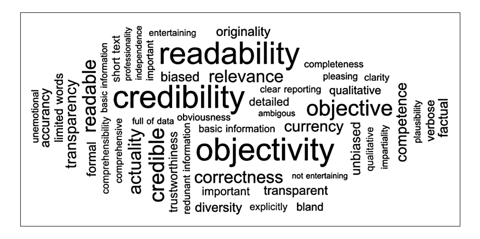
Figure 2: Word cloud

Criteria such as actuality (4 out of 12), diversity (3 out of 12), thematic competence (3 out of 12) and relevance (3 out of 12) were also mentioned, but only by a few interviewees. Due to the low number of mentions, these criteria are not particularly meaningful, which is why they were not included in the further analysis. Also noteworthy is the fact that no differences based on gender or age in the perception of algorithm-generated news could be identified. This may be ascribed to the limited number of participants, as this study is a small-scale study by design.