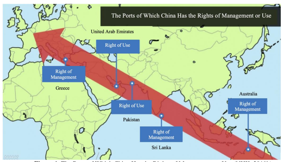
Figure 1. The Ports of Which China Has the Rights of Management or Use (NHK, 2019b)

Despite the changing discourse, Japan still approaches to the BRI in caution, and sees it more than an interconnectivity project. In 2019, NHK, Japan's national broadcasting channel, published a three-part article series on the BRI on its official website. The articles aim to explain what the BRI is, and it can be suggested that they also represent Japan's standpoint. The first article points out to the ports that are managed by China, via the BRI. It is stated that every country has access to the high seas, therefore, there is no point in drawing a line on the sea routes. Yet, the locations of the ports are of significance, as a state can position its military bases and navy vessels there. The article underlines that China finances the construction of various ports and gets their management rights, as is the case with Australia's Darwin port, Sri Lanka's Hambantota Port and Greece's Piraeus Port. This means that China can use these ports however it wants and can even deploy armed ships (NHK, 2019a).