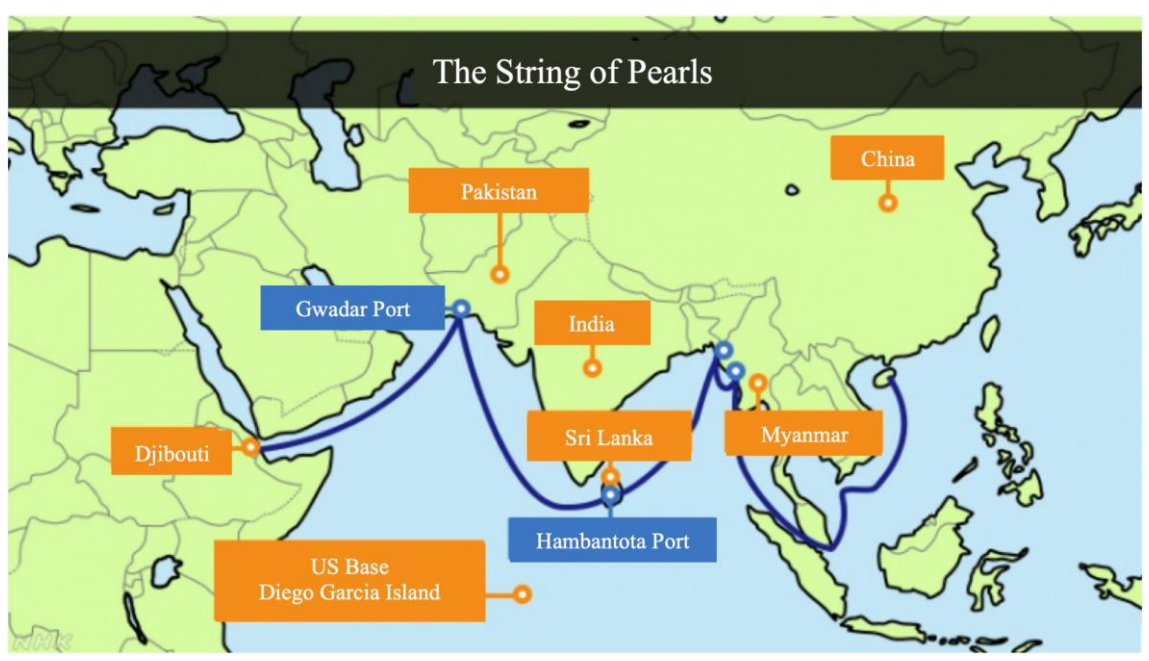
Figure 3. The String of Pearls (NHK, 2019b)

In May 2017, a month after Gwadar was leased to China for 40 years, Japan and India announced the Asia – Africa Growth Corridor. The project was declared in India in the 52^{nd} meeting of the African Development Bank. It is also remarkable that the project was announced a week after the Belt and Road Forum in Beijing. The foundation of the Asia – Africa Growth Corridor, in fact, is based on the Japan – India Joint Declaration, dated November 2016. In this declaration, it is emphasized that both countries should encourage industrial corridors and networks in Asia and Africa (Panda, 2017).