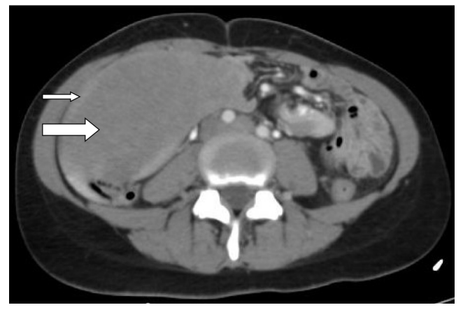
Figure 1a. Contrast-enhanced abdominal CT in axial view: Splenic enhancement like capsular rim (thin arrow) with reduced parenchymal enhancement (thick arrow) located in the right lower quadrant

On ultrasound images, the spleen was not at its normal site. Instead, it was located in the right lower quadrant and increased