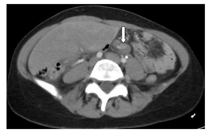
Figure 1b. Contrast-enhanced abdominal CT in axial view showing; the splenic vascular peduncle rotated around itself (whirl sign)