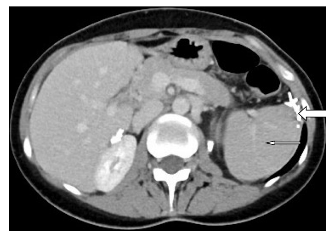
Figure 1d. Spleen (thin arrow) in its normal size and localization and suture materials (thick arrow) after surgery

Radiologists play an essential role in diagnosing the wandering spleen and its complications<sup>8</sup>. The most reliable and least invasive method of making the diagnosis is with ultrasonography, which can demonstrate the characteristics and localization of the spleen. The Doppler ultrasonography provides information about vascular structures, while ectopic position and torsion of the spleen appear on computed tomography and magnetic resonance images. The whirled appearance is a particular sign of torsion of the splenic pedicle<sup>9</sup>. Besides, a loss of parenchymal enhancement and rim enhancement of the splenic capsule are typical findings too In this patient, these findings were present together (Figures 1a, b, and c).