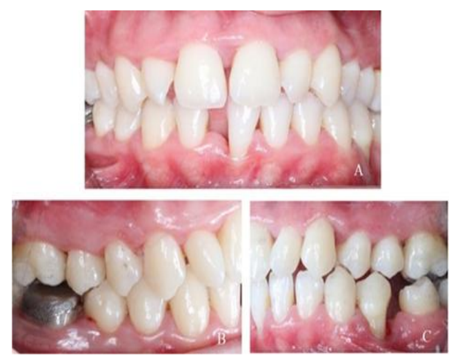
Figure 1: Intra-oral photographs before treatment; (A) frontal photograph, (B) right buccal photograph, (C) left buccal photograph

Radiographs demonstrated vertical bone loss in the central, lateral incisor and molar regions in the maxilla and mandible; and in the other regions