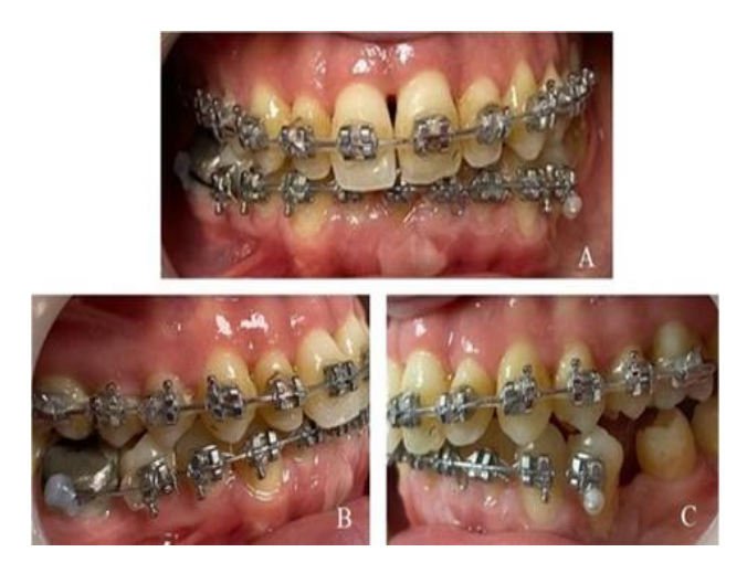
Figure 3: Intra-oral photographs during orthodontic treatment (A) Intra-oral frontal photograph, (B) Intra-oral right buccal photograph, (C) Intra-oral left buccal photograph.

to #41 and #34 at the end of four weeks following flap operations. FGGs were harvested from the right side of the palate and fixed in the recipient bed. Fixed orthodontic treatment was started six weeks after the healing of FGGs. Bonding was preferred instead of banding the molars to decrease plaqueretentive surfaces. Space closure in the anterior region were performed by retraction of mandibular and maxillary incisors using eight ligatures on stainless steel archwire with light continuous force. Arches were well aligned with normal overjet and overbite at the end of two years. Orthodontic treatment still continues. (Figures 3A, 3B, and 3C).