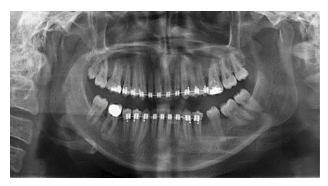
Figure 5: Panoramic radiograph of 2-years following of periodontal treatment

After two years, teeth were aligned, and periodontal health was preserved. Alveolar bone gains were observed in the panoramic film in #16, #21, # 26, #41, #34, and #46 (Figure 5).