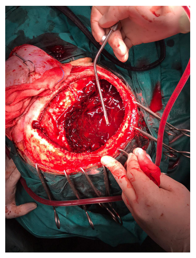
Figure 3: Peroperative view