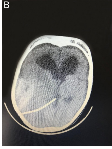
Figure 2: Postoperative BCT figures. A. Immediately after surgery. B. 1 week after surgery

in the right hemisphere (Figure 1). The patient underwent emergency surgery (Figure 3). Most of the hematoma was drained and no fracture was observed in the bone (Figure 2). However, she intraoperatively developed respiratory arrest. The dura was suspended, and the bone was replaced rapidly, and the operation was terminated. The patient remained connected to mechanical ventilator for 2 days, and she was extubated on the 3<sup>rd</sup> day. The GCS score of the patient who gained consciousness was 15. The paresis in the left upper extremity persisted when the patient was discharged.