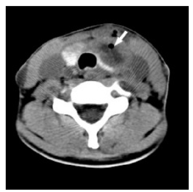
Figure 2. In axial neck CT image, the density of the left lobe of the thyroid gland was decreased and hypodense abscess containing air value was observed.

Anamnesis, physical examination, laboratory and radiological examinations are extremely important in the diagno-