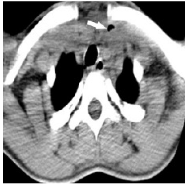
Figure 3. Inferiorly, this abscess area and air values were observed to extend towards the thoracic entrance