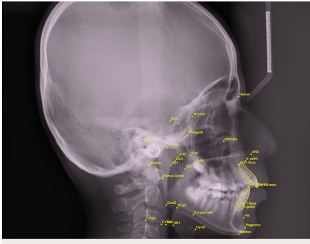
Figure 1 Cephalometric points.