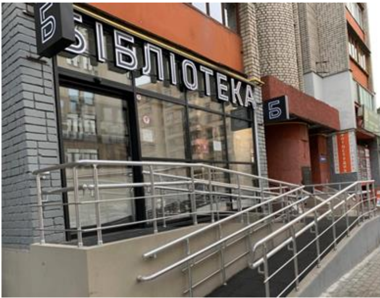
Figure 4. Identics of the Valia Kotyk Children's Library

A common feature is also the internal zoning of the library space. Thus, the internal space of the Central District Library "Svichado" consists of reference and information, communication and information, interactive, information and intellectual zones and a "minibib" for younger users (game area). The learning space of the Taras Shevchenko Central Library for Children is shown in Figure 5.