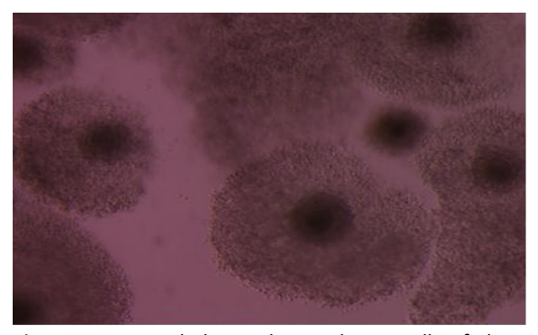
Figure 1. Expanded cumulus oophorus cells of sheep oocytes after in vitro maturation.

incubated for 18 h fertilization at 38.5 °C in 5% CO_2 . Osmotic pressure of HSOF medium was 283±10 mOsm/kg and pH was 7.2-7.4.