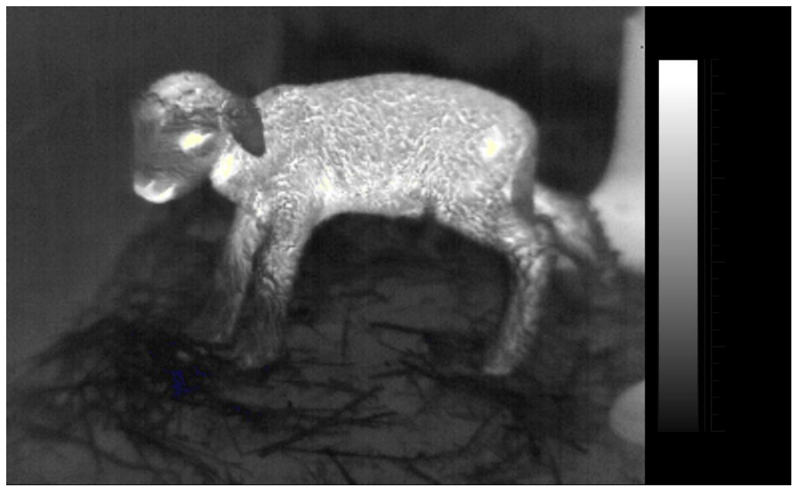
Fig.4 Good thermal insulation of birthcoat in postnatal lambs (at 5 °C)

IRT. The lowest heat losses were recorded in the Šumavská breed. The results showed that cold resistance of postnatal lambs is influenced by breed and by birthcoat character and that the Šumavská breed is better adapted to cold and rainy conditions than the Merinolandchaf breed and the crossbreeds Suffolk x Merinolandschaf and Suffolk x Šumavská (Figure 3 and 4). The results obtained by IRT were confirmed by biochemical and haematic analysis.