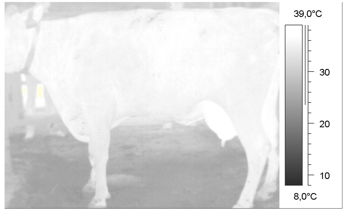
Fig.1 Thermal profile of dairy cow under different air temperatures (at 27 °C)

Kimmel et al. (1992) studied the effects of evaporative cooling on heat stress of Israeli-Holstein dairy cows in summer, where IRT was used to measure differences between temperature zones on their bodies. For two hours, the cows were alternatively sprinkled with water for 0.5 minutes and cooled with a flow of air (3m.s<sup>-1</sup>) for 4.5 min. Their rectal temperature dropped from 38.2°C to 36°C and remained unchanged for another hour. Thermograms of the cows also revealed a drop of 1.5°C in body surface temperature caused by the cooling. As a part of research into the protection of cattle against high ambient temperatures, Knizkova et al. (1996) made an experiment involving thermographic monitoring of body surface temperatures immediately before and after cooling, 15, 30 and 45 minutes after cooling, and after complete drying. They also wanted to identify the warmest zones on cattle that were exposed to high ambient temperatures. Air temperatures at the time of the experiment were between 27 and 31°C. The cattle were sprinkled for 60 seconds with water by means of special nozzles mounted above. Evaluation of the thermograms showed that the warmest zones included the neck, shoulder and rib regions (Figure 1). After a 60 second period of cooling at given ambient temperatures, the mean body surface temperature dropped by 1.2°C for 45 to 60 minutes. An evaluation of naturally ventilated dairy barn management by