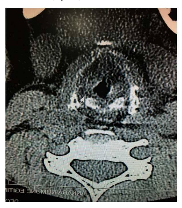
Figure 2. Laryngeal computed tomography section demonstrating subglottic stenosis.

Arterial oxygen saturation was normal. Physical examination of upper airways revealed nasal septum deviation and nasal concha hypertrophy. Thyroid examination with ultrasonography was normal. Laryngeal computed tomography (CT) showed subglottic stenosis revealing the underlying pathology for fixed UAO (Figure 2).