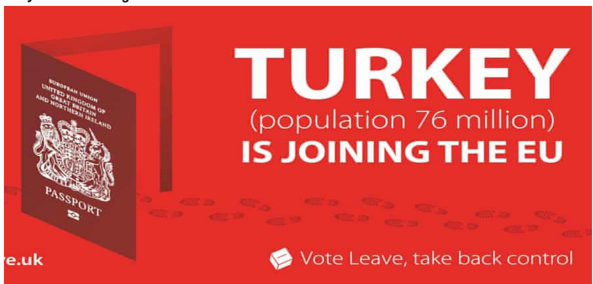
Figure 2. 'Turkey (population 76 million) is joining the EU'.

Social unrest brought by the Arab Spring in the Middle East accelerated the migration from the region, prompting Europe to perceive this wave of migration as a threat. Consequently, Europe primarily wanted to protect its borders. Turkey played an important role at this point. Its border with Europe carried it to an even more critical point. As a member of the European Union, Britain used these political developments, which marked their place in the social memory, as an argument to leave the EU.