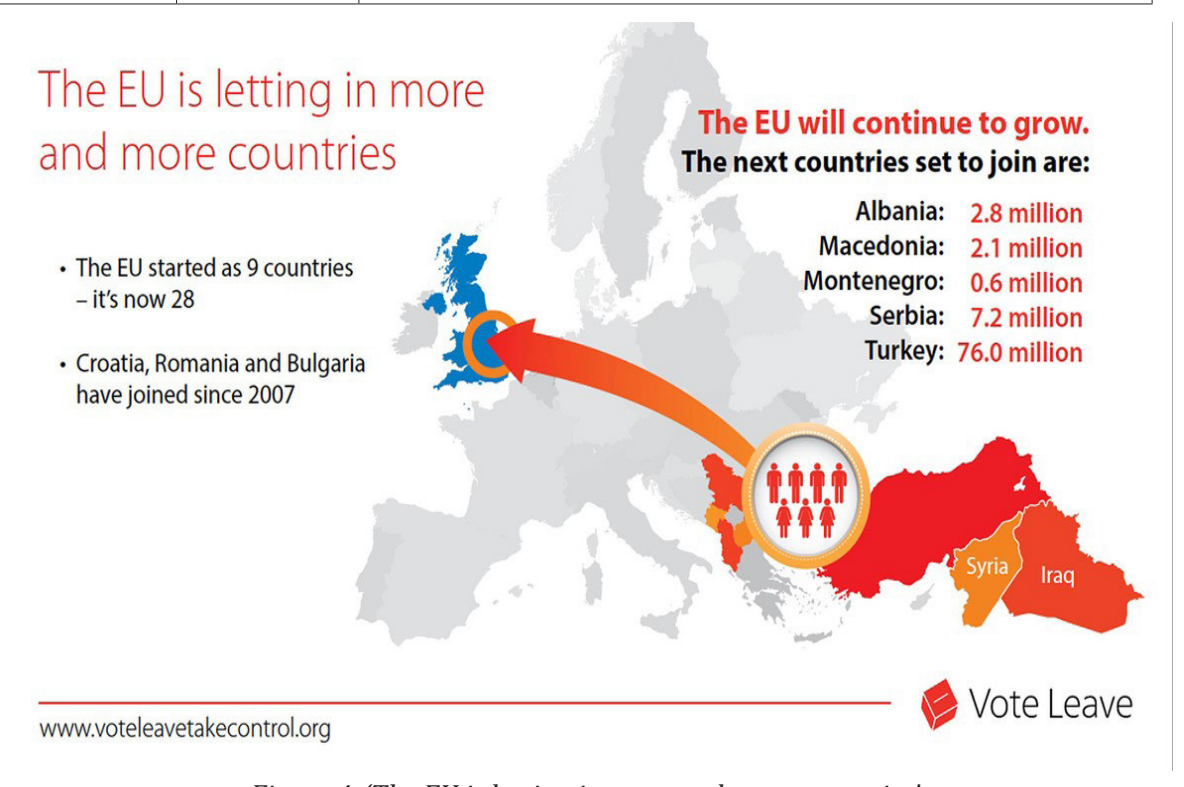
Figure 4. 'The EU is letting in more and more countries'.

Europe's potential for expansion is illustrated in Figure 4. The statements "The EU is letting in more and more countries" and "The EU will continue to grow" emphasizes Europe's increasing growth and inclusion of more and more countries. The statement "The EU started as 9 countries – it's now 28" written in smaller fonts support this claim. In addition to this, the statement "Croatia, Romania and Bulgaria have joined since 2007" is meant to increase the credibility, followed by a list of countries with their population ratios under the phrase "the next countries set to join are". These countries are listed as Albania, Macedonia, Montenegro, Serbia and Turkey, respectively. Among them, Turkey has the largest population. Accompanying these statements in the image is a map that