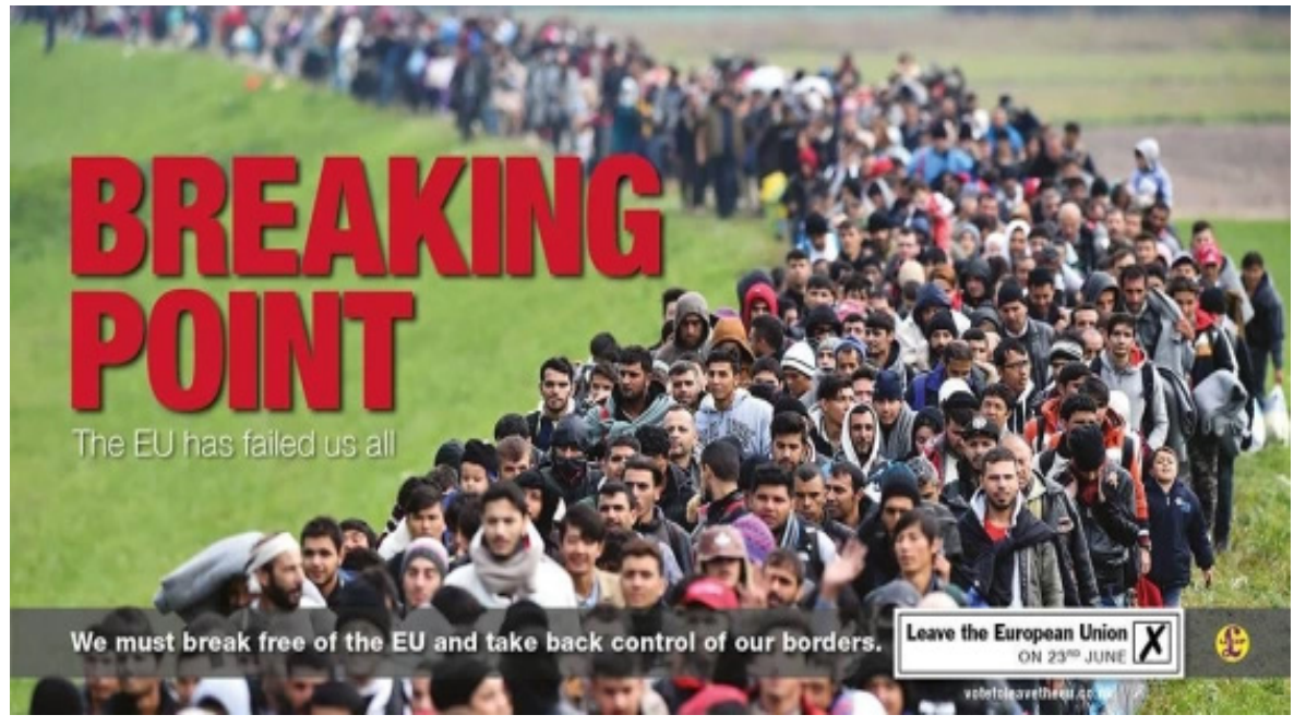
Figure 3. 'Breaking Point'.

Again, migration is used as the main theme in this poster titled Breaking Point. However, this time there is a real image on the poster, which shows a dense crowd, comprised mostly of men, heading towards a place. On the poster, there is a text that says "Breaking Point" in red large fonts and another text in smaller fonts just below it. At the bottom of the image is the statement that says "We must break free of the EU and take back control of our borders." The text "The EU has failed us all" right below this statement emphasizes