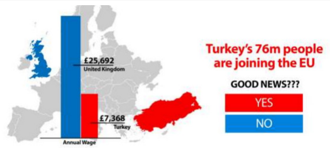
Figure 6. 'Turkey's 76m people are joining the EU'.