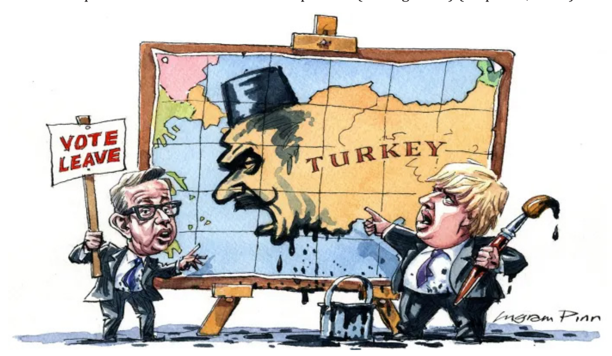
Figure 1. 'Vote Leave'.

In Financial Times, the separatist campaigns were covered with the headline "The Brexiters' ugly campaign to vilify Turks" and the ugliness of the campaign was underlined. The reference to the birth rates in Turkey was also mentioned in the article, addressing the inclusion of statistics concerning high birth rates in Turkey and warnings that the British National Health Service would be overwhelmed by Turkish mothers-to-be in the campaigns. The article also mentioned the high crime rates in Turkey and how maps illustrating that Ankara's accession will expand the borders of Europe to Syria, a war zone, were also used in this process. The article in question was one of the harshest criticisms of the anti-Turkey campaigns in the Brexit process. A cartoon in which Boris Johnson is portraying Turkey as an aggressive Ottoman was also included within the article. The cartoon in question summarizes the whole process (see Figure 1.) (Stephens, 2016)