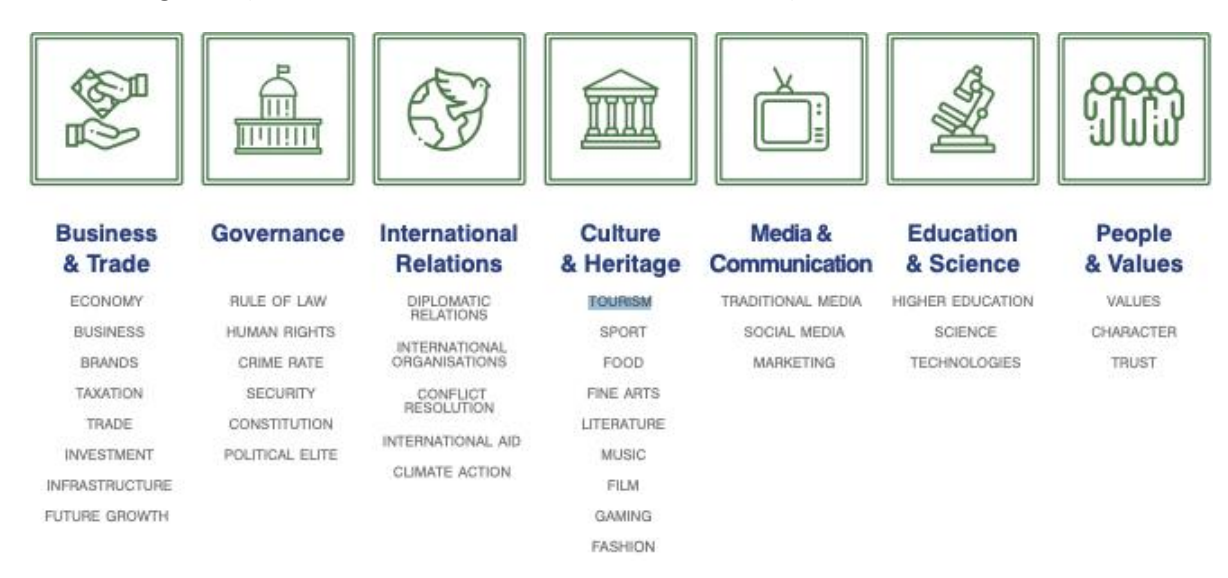
Figure 1. Soft Power Components (Brand Finance Global Soft Power Index, 2021).

Brand Finance, reputable in the country image ranking, expressed the soft power components with the following titles (Brand Finance Global Soft Power Index, 2021).