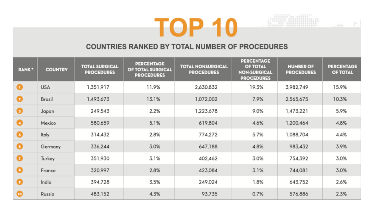
Figure 4. Countries Ranked by Total Number of Procedures.