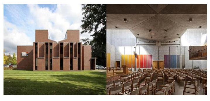
Figure 2. Louis Kahn - Unitarian Church-Rochester

tried to enter as much sunlight as possible into closed places. Roof lights or skylights are the daylight elements that Architect Kahn used frequently. Seen in the Unitarian Church-Rochester Figure 2, designed by Louis Kahn (URL 2).