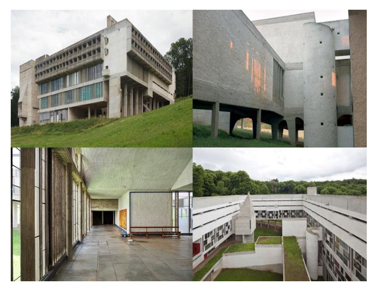
Figure 3. Le Corbusier - Sainte Marie de La Tourette