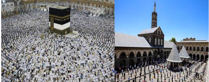
Figure 1. The Kaaba (Qibla) in Mecca and Diyarbakir Ulu Mosque.

Whatever the type of place, light is an important factor for the action to be taken in it. Light is the most important element necessary for the place to be seen, perceived, and used (Cengiz and Cengiz, 2018:Cengiz et. al. 2018:Parlakyıldız et. al. 2020:Palta et. al. 2017:Yaylak et. al. 2017:Akalp et.al. 2021). Considering daylight as a building element while designing the architectural place creates different and original results in the design. Concepts of daylight, place, design, and perception affect the physical and symbolic design of natural light in architectural places (Ünver, 2003, Fitöz and Erkin, 2007:Arias, 1993:Ünver, 2000: Aksugür, 1977: Djalilova and Sahin, 2020: Köknel Yener, 2002:Ander, 1995). In this context, the use of daylight and its effect on the design of the building should be examined in the context of place. For this purpose, the use of daylight in the designs of modern architects of the recent period has been examined. A selection was made among the main architects who used natural light in various forms in their designs and accepted this as a design principle. By comparing the physical use of daylight, that is, the way the light is taken into place, the places