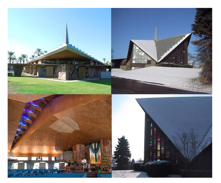
Figure 5. Frank L. Wright- First Christian Church

It has been observed that Ando uses daylight symbolically in the examined residential and religious buildings. The architect took the daylight into the place more in the vertical direction and preferred wide glass windows against the concrete surfaces in the horizontal direction. Ando establishes a relationship with nature in his designs, therefore he prefers massive masses in buildings where the function is appropriate, creating a sharp contrast of light and shadow on the walls with the light taken in through long and narrow strip windows. In their buildings, light adds depth to the place. The architect uses glass surfaces as thin horizontal stripes or on large surfaces. In his works, it is seen that his relationship with light design is at the forefront. Seen in Light Church Figure 6, designed by Tadao Ando (URL 7).