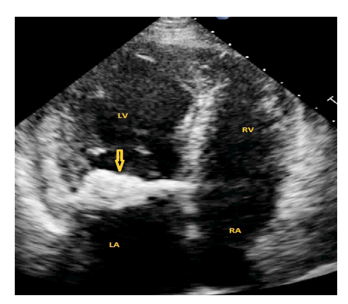
Figure 1. Transthoracic echocardiography four chamber (A) and two chamber (B) view showed a round mass with an irregular borders of 22x29 mm attached at mitral valve posterior leaflet (arrow).

ined by multimodality imaging allowed for definite diagnosis of PFE and subsequent planning of the surgical approach. Subsequently, the patient was referred to department of cardiovascular surgery for the operation.