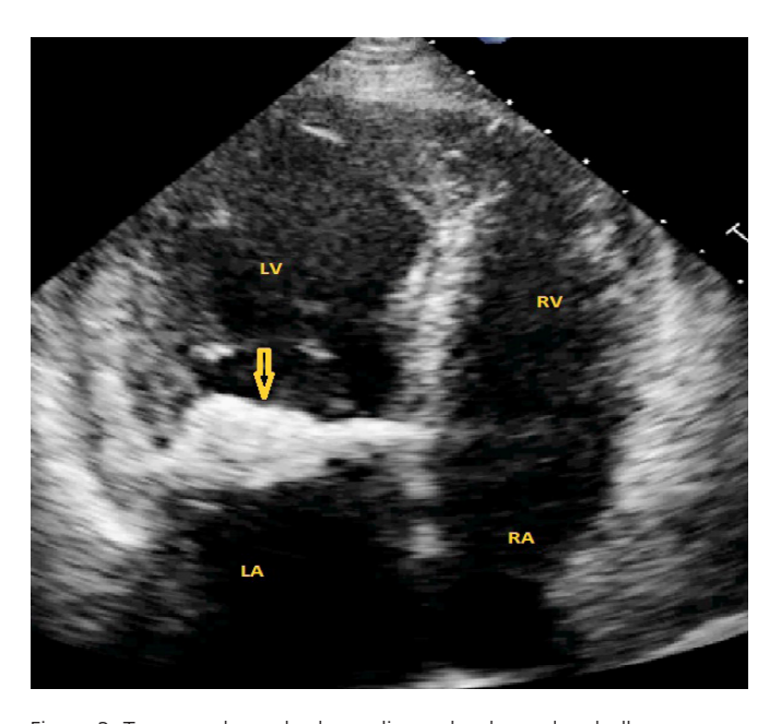
Figure 2. Transesophageal echocardiography showed a bulbar mass of 22x29 mm attached at mitral valve posterior leaf let (arrow).