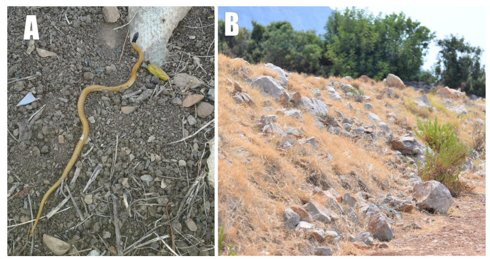
Figure 2. A) A male individual of Rhynchocalamus melanocephalus in the Gözlüce population. B) A general view from the habitat of Rhynchocalamus melanocephalus in the Gözlüce neighborhood of Yayladağı-Hatay.