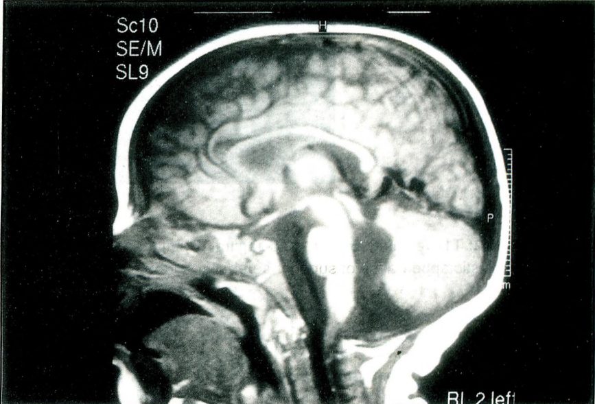
Fig. 1: Case 1: T1-weighted coronal (A) and sagittal (B) images show agenesis of cerebellar vermis and the dysplastic appearance of superior cerebellar cortex