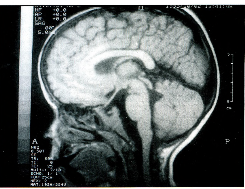
Fig. 2: Case 2: T1-weighted axial (A) and sagittal (B) images show partial agenesis of cerebellar vermis and dysplastic appearance of superior cerebellar cortex

cannot be explained on the basis of common timing; for example occular abnormalities are thought to occur at a much later embryonic stage than the formation of vermis (3).