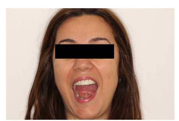
Figure 3. Extraoral view of the patient 1 week after the surgical drainage of the abscess. Note the increase in the mouth opening.

The patient's blood count was within normal ranges. However she had a high C-reactive protein (CRP) measurement of 1.17 mg/L. The patient's history revealed numbness of the lower lip in the affected side. Swelling was visible in the right temporal region. The pain was most intense in the retromaxillary region during palpation. When the aspiration of puss was achieved using a 5 cc syringe, the abscess was drained through an intraoral incision in the tuber region. The incision was done using a No: 15 surgical blade, then drainage of the puss was done using a blunt forceps followed by drain insertion. The patient was prescribed 600 mg of intramuscular clindamycin twice a day and 500 mg of ornidazole twice a day orally. 20 mg of tenoxicam was also given orally once a day for pain relief and to reduce the inflammation. The systemic condition of the patient started to improve on the following day. The anesthesia of the lower lip started to decrease and the patient started to feel paresthesia on the third day following the drainage. The drain was removed on the same day. Postoperative MR images showed a decrease in the abscess. The mouth opening reached its normal range on the fifteenth day (Figure 3) and the numbness of the lip recovered completely on the 3<sup>rd</sup> month.