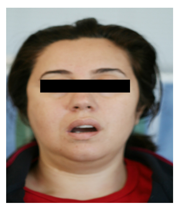
Figure 1. Extraoral view of the patient showing restricted mouth opening.

A 38 years old female patient was referred to our clinic with complaints of severe pain, restricted mouth opening (Figure 1), swelling in the temporalis muscle region, fever, and malaise following the extraction of the upper right third molar tooth. The patient stated that her complaints have started 9 days prior to admission. Three days after the extraction of her upper right third molar tooth she claimed to have felt pain and swelling in the related region. She also reported that multiple injections had been performed by her dentist in order to obtain sufficient anesthesia.