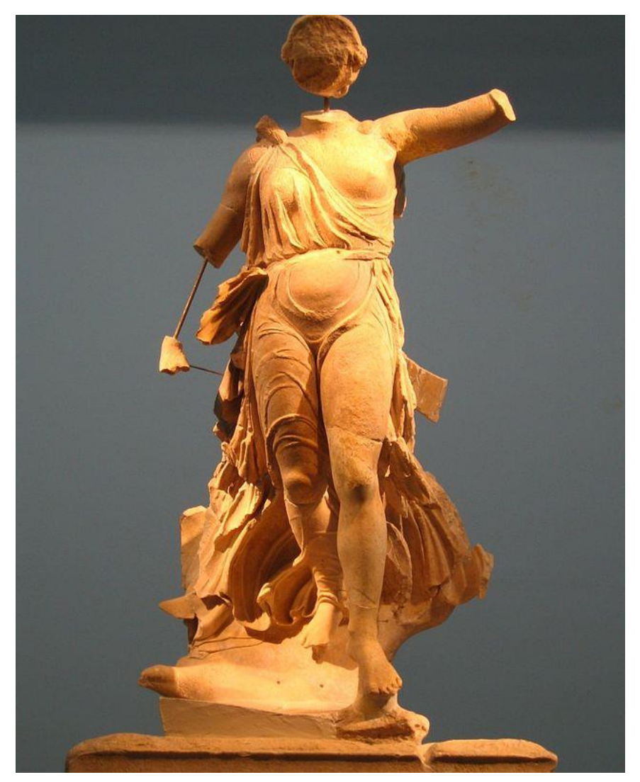
Fig. 4. Nike of Peonio of Mende (c. 425 BC) (https://it.m.wikipedia.org/wiki/Peonio_di_Mende)

Trakya University Journal of Faculty of Letters, Volume: 13, Issue: 25, January 2023, pp. 23-33.