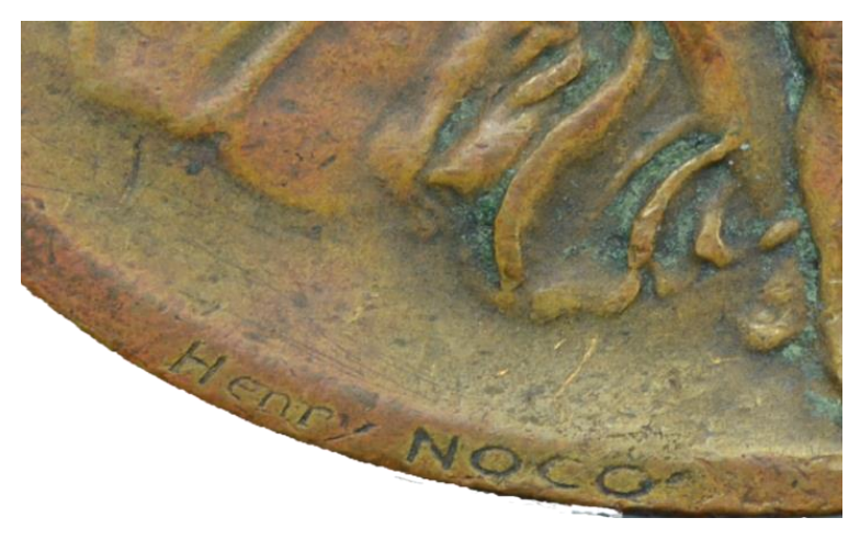
Fig. 2. The signature of the engraver, Henry NOCQ, on the lower outer edge, on the Obverse, slightly offset from the center line of the winged Nike figure

The exemplar is also devoid of the hook which was to serve to support the multicolored ribbon: most likely, since it is an 'external' element, that is, subsequently added to the minting of the medal, it has detached and been lost, or detached on purpose to preserve only the medal's round (Tab. IV, figs. 7a and 7b). This exemplar is part of the 'Type 1', out of four identified, and also called the 'Official Model', of a classification based on small characteristics and variations in the position, in the yield, or in the absence of the engraver's name, and on the presence or absence of the Greek article 'O' on the Reverse: in this case, in fact, the engraver's name, Henry NOCQ, is placed on the lower left outer edge, and not inside the disc, as in the "Type 2"; moreover the name is rendered in lowercase letters, with the exception of the initial H, and the surname instead is entirely in capital letters (Fig. 2), while in the 'Type 2' both, the name and the surname, are rendered in capital letters.<sup>13</sup>