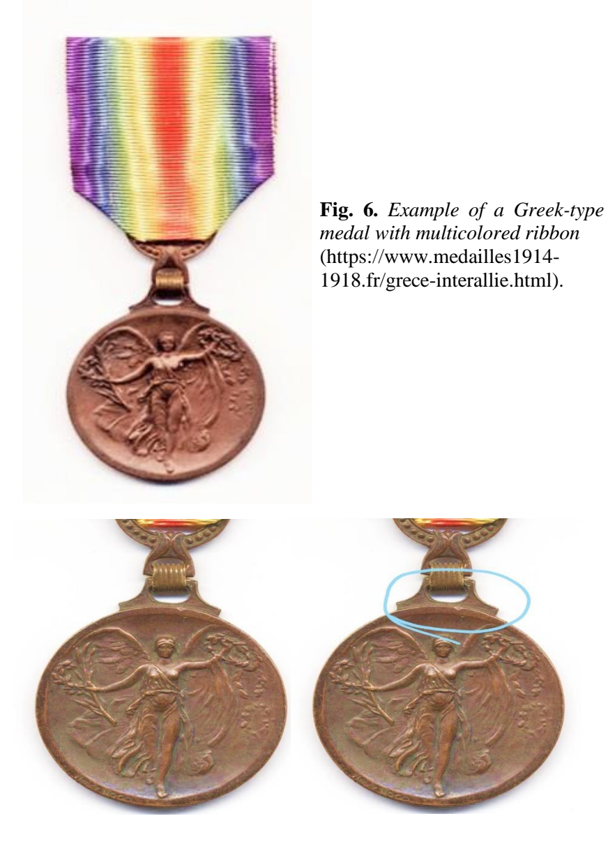
Figs. 7a and 7b. Detail of a Greek-type medal with the hook for the multicolored ribbon

Trakya University Journal of Faculty of Letters, Volume: 13, Issue: 25, January 2023, pp. 23-33.