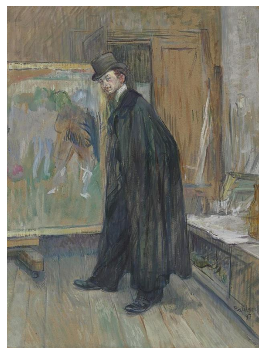
Fig. 5. Toulouse-Lautrec: portrait of Henry Nocq (1897)

Trakya Üniversitesi Edebiyat Fakültesi Dergisi, Cilt: 13, Sayı: 25, Ocak 2023, ss. 23-33.