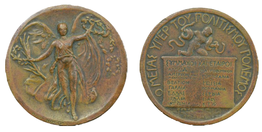
Fig. 1. Obverse and Reverse of the medal from Yozgat

2. The 'Inter-Allied Medal of Victory' (Greek) from the Yozgat Museum.