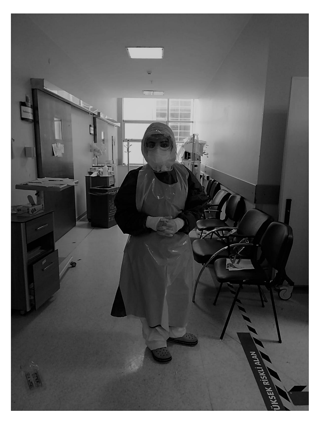
Figure 1. A nurse in intensive care unit

data saturation was reached due to non-emergence of new codes or themes. achieved. The sample of the study consisted of 15 nurses.