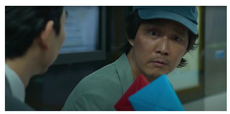
Image 1: The main character of the film, Seong Gi-Hun, is invited to the game through red and blue envelopes.

Following these initiatory plans, the storyline of the Squid Game is rapidly evolving. A person who is dressed extremely stylish and looks like a human resources manager of a company approaches Gi-Hun, who is sitting helplessly at the subway station, and offers the main character to play a fairly simple children's game. In this scene, the audience also witnesses how the main character, Seong Gi-Hun, is invited to the game. The person who comes to him has two game squares, one red and one blue. In the game to be played, Gi-Hun will receive 100,000 Won per round he wins, but in return for the rounds he loses, the person offering the game will slap him.