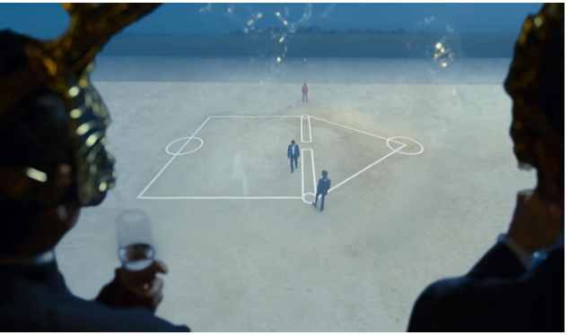
Image 11: The last game in the Squid Game series. One of the players in the arena will die and the VIPs are watching them.

It can be said that Byung-Chul Han's conceptualization of psychopolitics within the scope of the analyze today's world is used together with a historical background such as the gladiator fights in Rome, creating a distinctive dramaturgical background for the series. As Han (2019) stated, a new process gamified by excitement capitalism has begun to dominate all of life. The person playing the game is subject to domination and therefore the titles that Huizinga defines as 'the positive functions of the game' are invalidated particularly for Squid Game . The fact that the positive features of the game such as teaching and exploring the world have disappeared, that the entertainment has turned into a tool only revealing the sadistic