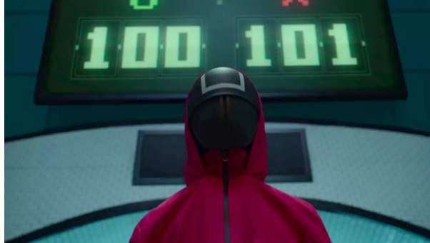
Image \ 7: \textit{Oh} \ \textit{Il-nam-Designer of the games in the Squid Game}

When the voting is tied, the vote of Oh II-Nam, number 001, the oldest of the contestants, will decide the fate of the contestants. After thinking for a long time, Oh II-Nam votes to temporarily end the game. Following this stage, the contestants will return to their homes, and after, the second game will continue with those who want to return to the game. In the last episodes of the series, it will reveal that Oh II-Nam is a very rich oligarch and among the head of the people who designed the game, so has a very sheltered position within this competition. However, at this stage, neither the other contestants nor the viewers have this information yet. The reason why Oh II-Nam joined this game is that he is too rich to enjoy no longer anything and therefore he wanted to play the Squid Game , a simulation of the games he played when he was little. At the end of this first episode, it is understood that the area where the Squid Game takes place is an island just like where the Survivor TV show takes place. Completely isolated from the outer world, this island is a law-free zone designed to