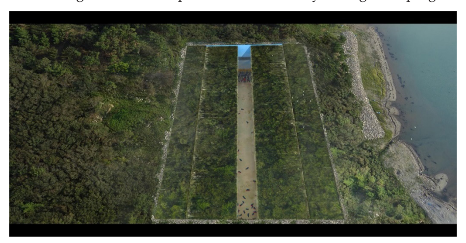
Image 8: After the first game is over, the island of Squid Game turns into a closed space, indistinguishable from the outside.

be invisible even to satellites, aiming to quell the wild emotions of the hyper-rich. The series can be read as an irony of Campanella's The City of the Sun (1981), one of the most important symbols of enlightenment thought. Squid Game discloses the bloody dystopia created at the point where the idea of enlightenment has reached. Frankfurt School intellectuals Adorno and Horkheimer in their Dialectic of Enlightenment (2010), state that technological progress does not bring about development either in a humanistic manner, modernization not only fail to realize the happiness promised to humanity but also built a bloodier world, and the capitalism also destroys rational thought such as compassion and humanity feelings as it progresses.