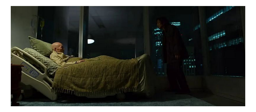
Image 12: In the final episode of Squid Game, Oh Il-nam and Seong Gi-hun got even with.

This scene demonstrates that everything has lost its meaning in the eyes of people brutalized by wild capitalism, and even revealed human life has no value.