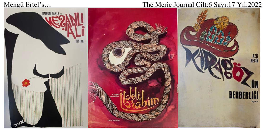
Image 2: Poster Designs by Mengü Ertel, Reference: (Bektaş, D. (2011)

Mengü Ertel's poster designs were examined in the context of the following question: "How is the use of visuals (photographs and illustrations) in poster design?" While the findings related to the use of photography are included in Table 3, the illustration (lines, textures, patterns) findings used by Mengü Ertel in his designs are analyzed within the scope of Table 4.