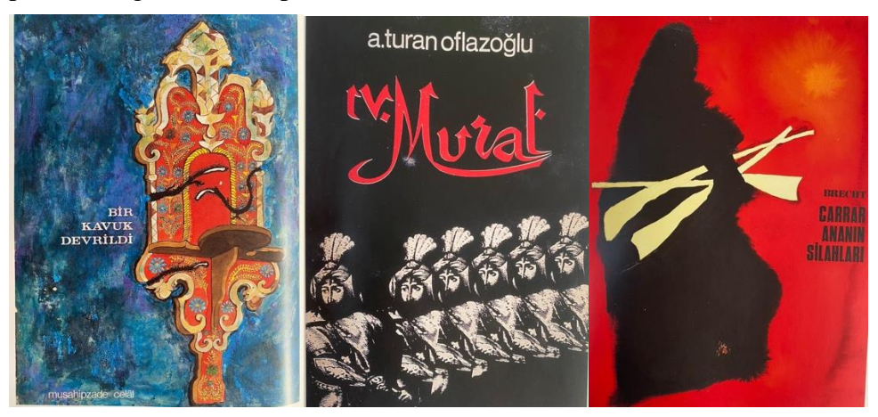
Image 4: Poster Designs by Mengü Ertel, Reference: (Bektaş, D. (2011)

When Table 5 shows the distribution of colors Mengü Ertel used during his poster designs, it is seen that Ertel used colors more intensely in his works between 1965 and 1976. While Ertel used the color white 29 times, the color yellow 38 times, and the color red and black 33 times when designing his posters, the number of uses of the colors blue, green, orange, brown and purple are very close to each other. When the table is examined in general, it is seen that Ertel mostly used the color Black (64). Yellow (61) ranks in the second place, white (55) ranks in the third place, and Red (54) ranks in the fourth place. The colors that the designer used the least in his poster designs were Purple (16), Brown (25) and Blue (26).