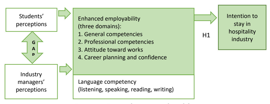
Figure 1. Research conceptual model

H<sub>1</sub>: Student intern employability has a direct effect on their intentions to remain in the hospitality industry.