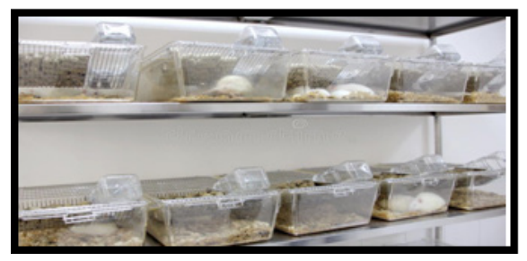
Figure 3. The image of Wistar albino rats treated with different concentrations of hydroalcoholic extract of Syringo-dium isoetifolium seagrass.

cultured in artificial seawater. Every 6, 12, 24 and 48 hours, the number of dead shrimps in each test tube was counted and recorded. The experiment was carried out three times in each concentration (n=3). Statistical analysis was used to calculate the proportion of deaths and the lethal concentration ( LC_{50} ).