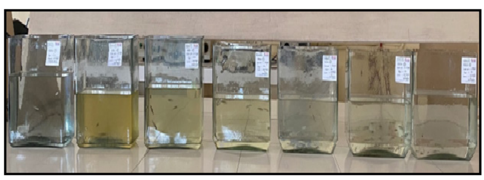
Figure 2. The image of Zebrafish treated with different concentrations of hydroalcoholic extract of Syringodium isoetifolium seagrass.