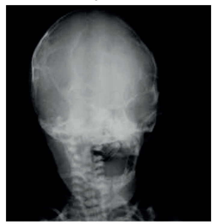
Figure 1. Skull X-ray of the patient demonstrating oval lucencies surrounded by dense ridges

Birth weight was 2700 g (10<sup>th</sup>-50<sup>th</sup> percentile), length was 46 cm (10<sup>th</sup>-50<sup>th</sup> percentile), and head circumference was 33 cm (10<sup>th</sup>-50<sup>th</sup> percentile). Overall the skull was very soft on palpation, the anterior fontanelle was large, soft and it was connected with