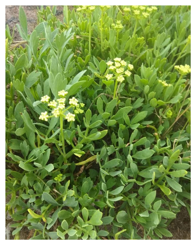
Fihure 1. Sea fennels were photographed from the shores of Giresun.

AA_{(t)}517 shows the extract absorbance at t = 30 minute