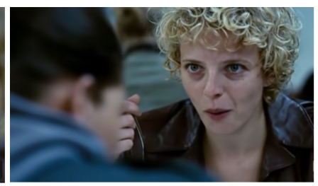
Figure 9: The mysterious Oriental as the object of knowledge and desire for the Western

Hints of Orientalism are also given with scenes of May Day demonstrations from Germany and Turkey. In Germany, it is pictured as just another day, people and bands march with banners and slogans; no police force is ready, passers-by watch the demonstrators, and there is no chaotic atmosphere. Germany is the signifier of the Western common sense. On the other hand, May Day demonstrations in Istanbul are characterized by a dominance of political extremism and conflict signifying the chaotic Orient (Figure 10).