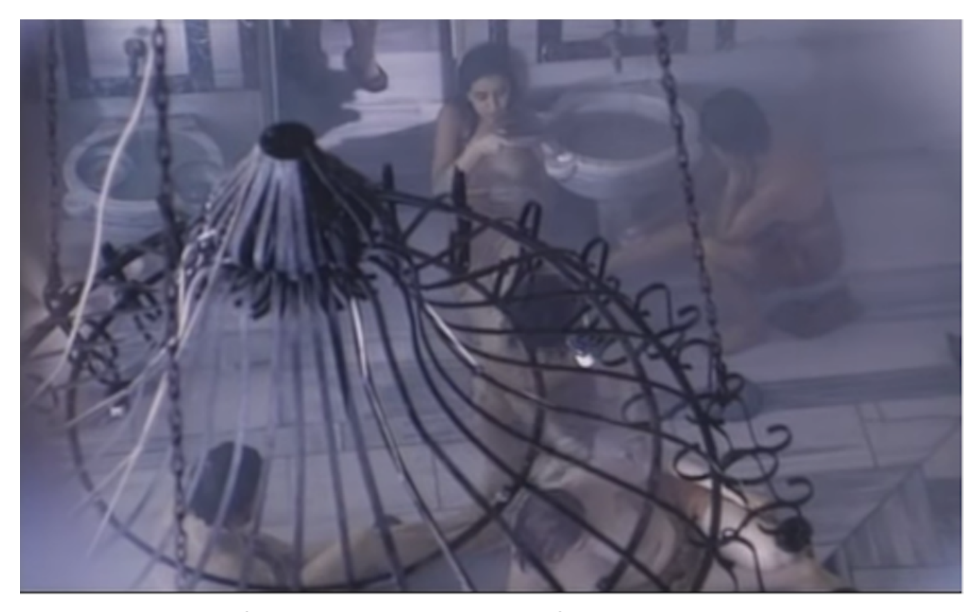
Figure 2: The partly nude female body as the passive object of the male voyeuristic gaze

Girelli (2007, p. 23-24) reads hamam as a symbol of Turkey, "a country which throughout the film remains profoundly exotic and archaic ... resting on Western notions of Oriental difference, antiquity, seduction, and alternative lifestyle", and she asserts that this Orientalist representation "depends on an original distance between the Self and the Oriental Other." In line with that, in the film, the beholders of the voyeuristic gaze, regardless of their designated gender roles as female or male, correspond to the phallocentric Western eye, and the Orient signified with a hamam is the object of it. The position of the camera or the choice of voice-over facilitate the spectator's identification with the gaze of the camera; in this case, the male-oriented Western eye.