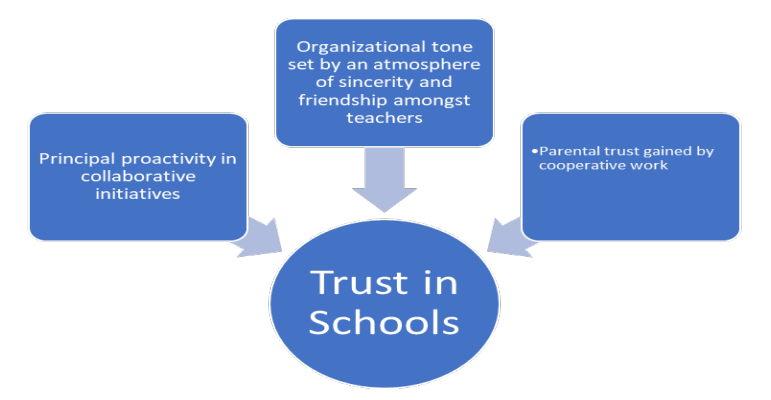
Figure 3. Trust in schools

The participants in the present study explicate that the trusting relationships in low SES schools stem from an atmosphere of sincerity and friendship. Moreover, an emphasis on cooperation