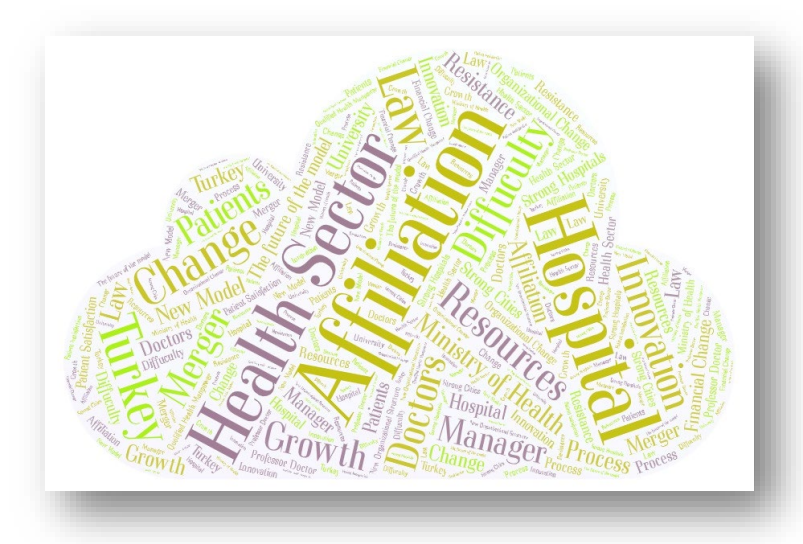
Figure-2: Word Cloud