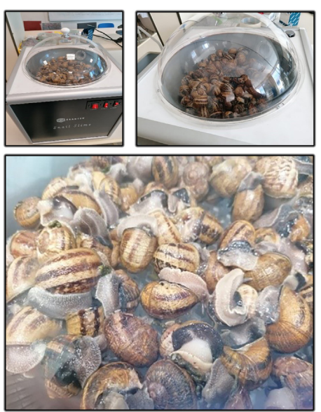
Figure 2. Treatment of snails with cold steam containing ozone and essential oil in a specially designed device

snails were exposed to cold vapor containing ozone and essential oils for 20 minutes (Figure 2). The secretion obtained after the application was filtered through a 0.45 micrometer filter, purified from possible bacterial load and solid particles, and kept at -20°C until the end of cream production and analysis (Das et al., 2022). The snails that were alive and unharmed after the procedure were returned to the Snail Farm (Figure 3-c).