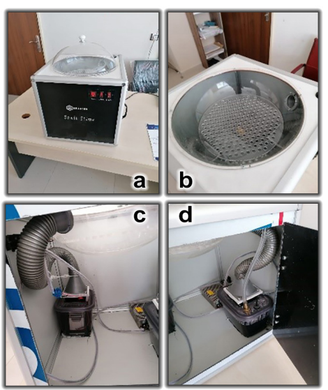
Figure 1. a. Snail secretion collection device b. Snail chamber c-d. Ozone and cold steam generators and secretion collection chamber

The snails provided for secretion are placed in the chamber in the instrument. Each of the essential oils was added to the cold steam generator at a concentration of 0.5 mL/L. The