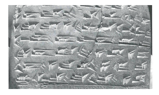
Fig.1: From Karmir Blur, Belonging to a Senior Office/Scribe<sup>5</sup> (Tablets of sent types)

For now, very few of the bureaucratic clay tablets that give information about the administrative and social structure in Urartu have been unearthed. However, their bureaucratic standards indicate that these few records may be the product of a much older state tradition and part of an extensive collection that has not yet been found<sup>3</sup>. The scarcity of such inscription examples causes the continuation of philological debates about the meaning of many words mentioned in the content<sup>4</sup>. However, it is possible to make some inferences about the administrative structure based on the existing records as a whole and some details.