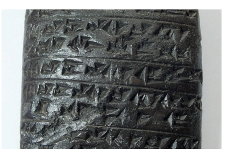
Fig. 2: From Anzaf, Probably Written by a Trainee<sup>6</sup> Scribe<sup>7</sup> (Tablets of not sent types)

Urartian bureaucratic records have some differences at first glance in terms of their features. The presence or absence of seal impression on the tablets is one of these differences. As a matter of fact, the very few Urartian tablets we have can be divided into two different