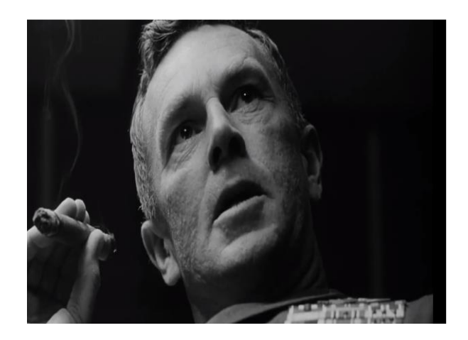
Figure 4. General Ripper while giving a speech is an American idol. Screenshot (Kubrick, 1964).

face" (Kubrick, 1964). Referring to the poisoning of bodily fluids by the communists; "Mandrake: When did you first develop this theory?