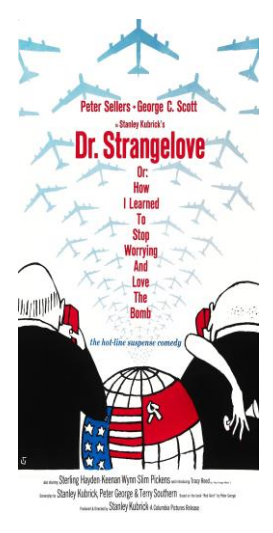
Figure 3. Dr. Strangelove film poster

The film Dr. Strangelove reveals with all its nakedness how the women are positioned in the society by the American right conservative mind. The first striking thing that can be perceived on the phenomenon of sexism in the film is showing only one woman from start to finish. This female character in the film only wears a bikini, is mostly in the bed. The woman is the secretary of General Buck Turgidson , an almost representative character of a