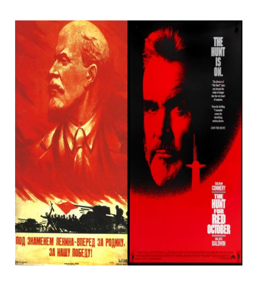
Figure 2. Example of Soviet propaganda poster on the left. On the right, film poster of The Hunt for Red October

Putin; There is no such thing as private papers in the Soviet Union. Such concept is antithetical to the collective good" (McTiernan, 1990).