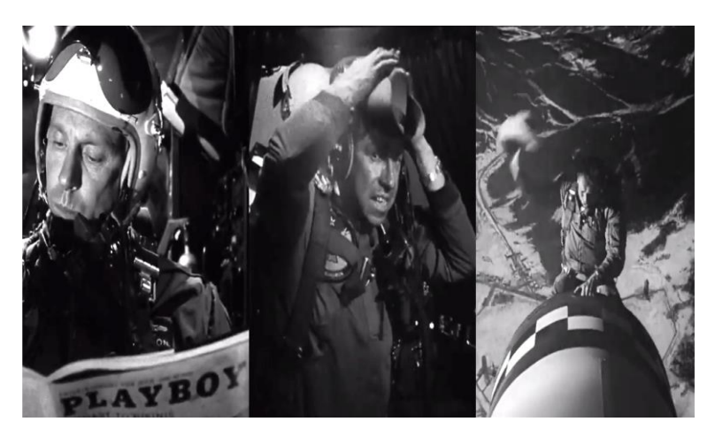
Figure 5. Major Kong; while launching the nuclear attack as a cowboy. Screenshot (Kubrick. 1964).

In the war courts held after the Second World War , the Nazi soldiers explained their war crimes and crimes against humanity as, "We are soldiers; we were doing what we were ordered to do. Therefore, we are innocent". Recognized in the international law perception, the principle that