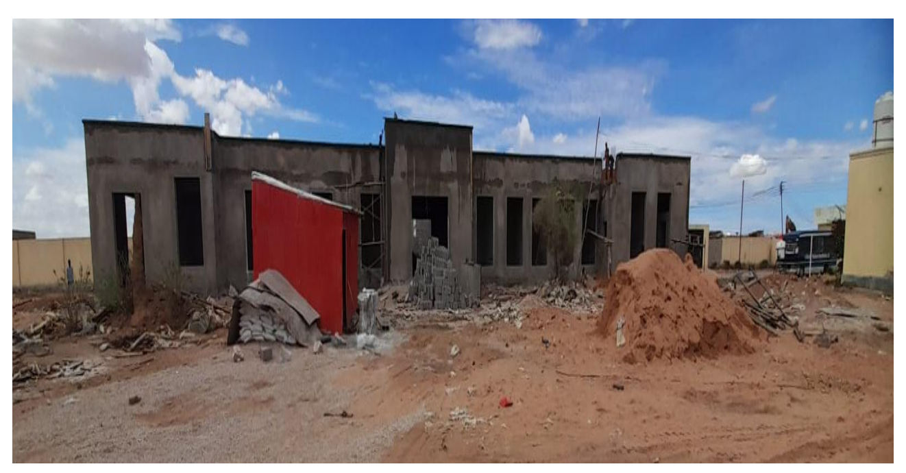
Figure 4. The current stage of the construction

The lack of critical facilities and an OHS expert points to areas that require immediate attention to ensure the smooth functioning and safety of the site. The varied completion rates across different structures indicate the ongoing nature of the project and the need for continued management and coordination to achieve completion.