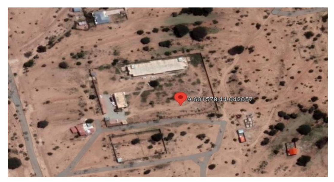
Figure 1. Location of the project on Google Maps showing previously existing buildings

In Lot 6, the project is more expensive, comprising several key facilities. The centerpiece is a laboratory and library building, covering a single-story area of 898 square meters. This building is poised to become a hub of learning and research, equipped with modern laboratory facilities and a comprehensive collection of academic resources. Adjacent to it is the kitchen and dining hall building, encompassing a space of 402 square meters. This building is designed to be a communal area where students and faculty can gather for meals, fostering a sense of community and collaboration. An essential component of Lot 6 is constructing an underground water tank with a capacity of 425 cubic meters. This facility ensures a reliable water supply for the new buildings and the college campus.