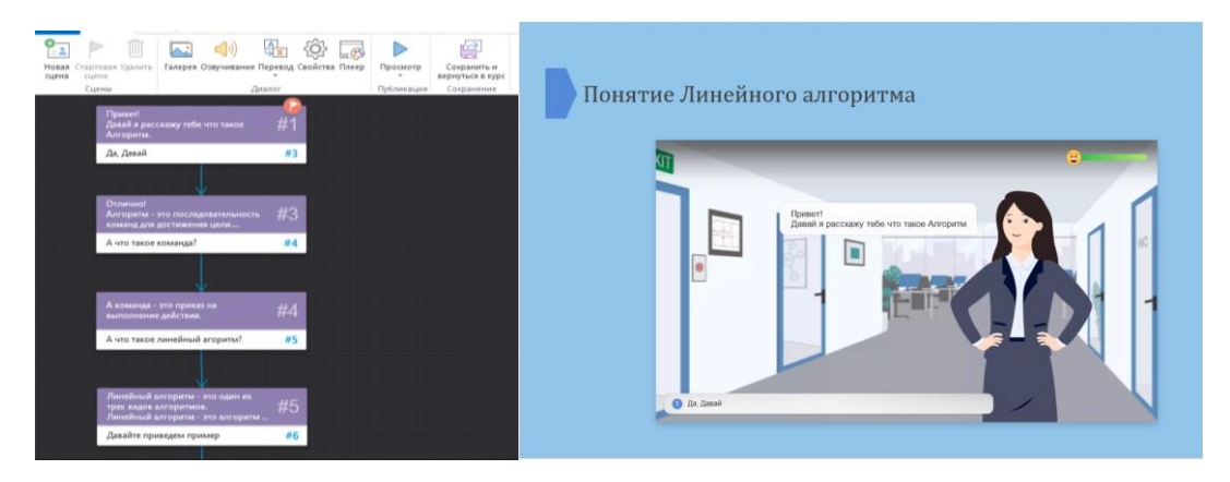
Figure 3: Interactive Simulator "The Concept of a Linear Algorithm"

To create a dialog simulator, go to the iSpring Suite tab in Microsoft PowerPoint (Figure 4) and click on the dialog simulator button (Figure 5), after which the dialog simulator creation window opens (Figure 6).