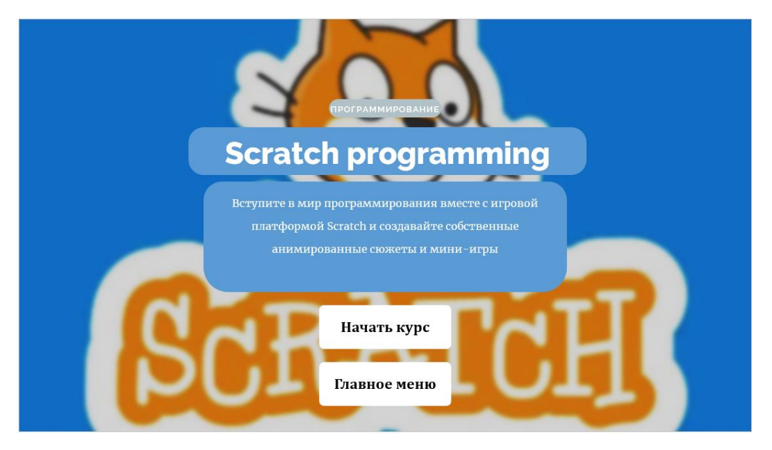
Figure 2: The course "Scratch Programming Training"

Using this technology, a training course on Scratch programming is being developed in the course designer iSpring Suite 11 (Figure-2).