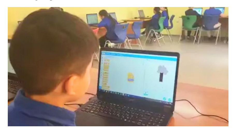
Figure-14: Conducting a lesson on "Repetition in Our Life"

The developed course was applied during Scratch programming lessons in 1 "A" (Kazakh language of instruction) and 3 "A" (Russian language of instruction) classes of the "ADAN" school (Figure-14,15). Since the number of students in the class does not exceed twenty people, classes are not divided into subgroups.