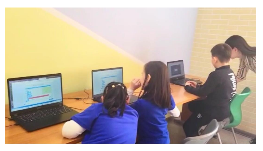
Figure-15: Conducting a lesson on the topic "Creating games"

The students were given the following tasks to consolidate their theoretical knowledge of Scratch: