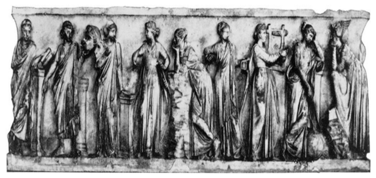
Figure. 1. MUSES, depiction of nine muses on a Roman sarcophagus, 1st century. ex. BC, Rome, Capitoline Museum

In a Roman sarcophagus of the c. I, paraK, we are presented with the nine muses carved on the decorative outer parts of the sarcophagus which is now preserved in the Capitoline Museum in Rome.