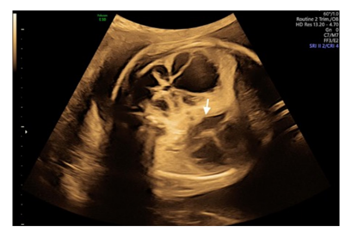
Figure 2. Macrocystic congenital pulmonary airway malformation (CPAM). Transverse sonographic image through the fetal chest demonstrates a multiseptated, primarily anechoic intrathoracic mass (arrow). Cardiomediastinal shift is present, with leftward displacement of the heart.