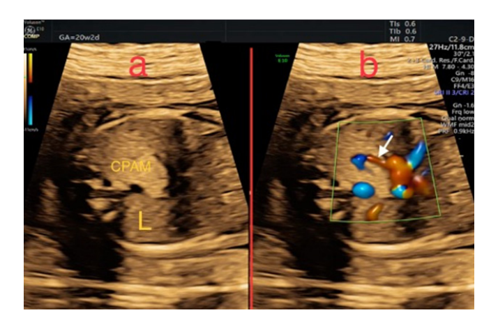
Figure 1. Congenital pulmonary airway malformation (CPAM). a Transverse sonographic image through the fetal chest at 20 weeks of gestation shows a hyperechoic mass (CPAM) and the normal intermediate echogenicity lung parenchyma (L) is visible. b Power Doppler US image of the same image shows a feeding vessel (arrow) from the pulmonary artery supplying the CPAM.

rent experience and to review current literature on the fetuses diagnosed prenatally with the following pulmonary malformations: CPAM, BPS and BC.