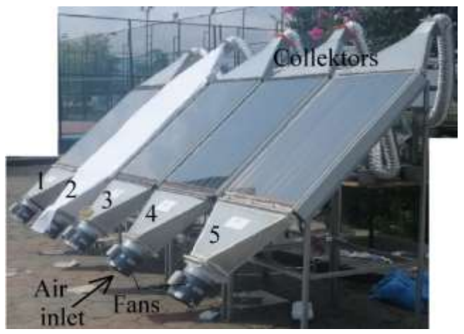
Figure 1. Five solar collectors used in the drying system.