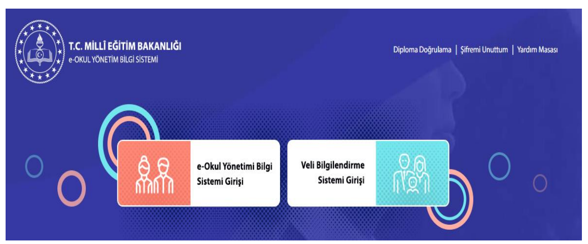
Figure 2. E-school user interface (URL-1, 2023)

With the e-school application, student transactions, school transactions, provincial and district directorates transactions, and Ministry-level transactions can be carried out as desired. Both administrators and families as the immediate stakeholders can use the E-school application as well. With that being said, one of the most essential features of this system is that it brings about transparency for the education services processes and gives rise to interactivity. At the same time, a considerable number of distance education platforms can be integrated into this very system, during times of crises like the Covid-19 pandemic. Integrating other education services units, such as Education Informatics Network (EIN) and the Teacher Informatics Network (TIN), into this system enables the acquisition of a high volume of data as a learning analytics tool. E-school application is actively used at present and appears as the most frequently used information source as a learning analytics tool.