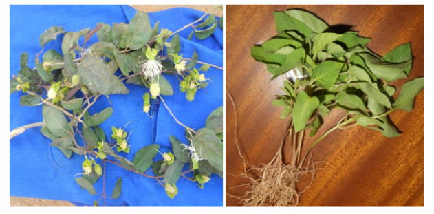
Leaves and flowers of Maerua angolensis Leaves of ipomoea eriocarpa Figure 4. Example of edible leaves.

The Endangerous species: In this category, plants are intensively harvested for their food, but also for craft, fodder and medicine. So species become more and more scarter. We can note: Afzelia africana, Boscia senegalensis, Pterocarpus lucens .