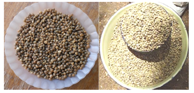
Grains of Boscia senegalensis Grains of Pakia biglobosa

Figure 3. Example of edible flowers and grains.