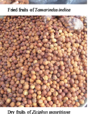
Figure 2. Example of edible fruits.