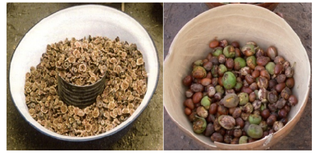
Flowers (sepals) of Bombax costatum