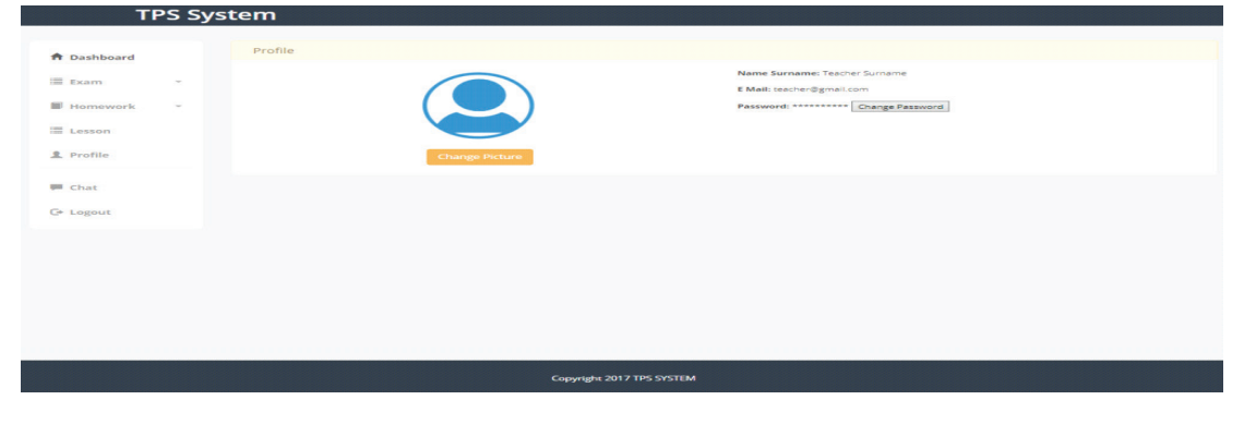
Figure 5. Teacher profile

In this page (Figure 5); the teacher views his / her profile. The teacher can change the profile picture and update the password on this page. When the "Change Picture" button is clicked, a field is opened to select a new picture and the teacher can upload the new profile picture. When the "Change Password" button is clicked, the teacher is required to enter the old password and the new password. If the old password does not match the password in the database, the password is not updated.