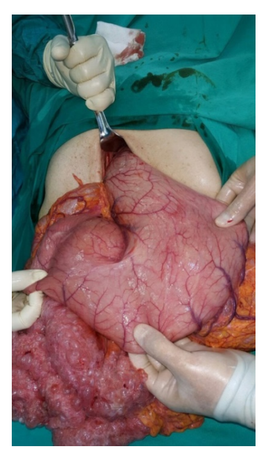
Figure 1. The stomach was found to be extremely dilated.

During exploration, the stomach was found to be extremely dilated (Figure 1), and on the intestines cystic formations limited to the serosa were observed, affecting a 120 cm length of small intestine starting 1 meter after Treitz ligament (Figure 2, 3, 4). In addition, polypoid formations were palpated in the lumen of sigmoid colon. Biopsy samples obtained from the serosa of small intestine and the polypoid formations inside the sigmoid colon were taken to intraoperative pathological assessment. No signs of malignity were found, and the lesions were reported compatible with pneumatosis cystoides intestinalis Subsequently, uncut gastrojejunostomy (with a jejunum segment prepared 50 centimeters from Treitz ligament) + truncal vagotomy + sigmoid colon repair operations were performed. Drainage tubes were placed near the gastrojejunostomy and the pouch of Douglas. No complications due to the operation were observed after surgery. Drains were withdrawn on day 3, and the patient was discharged on day 5. At 1 month of follow-up, the patient's complaints decreased and he started to gain weight. At 6 months of follow-up, it was determined that there was no active complaint, that the laboratory values were normal, and that he received about 8 kilograms. The patient was granted permission to share medical information.