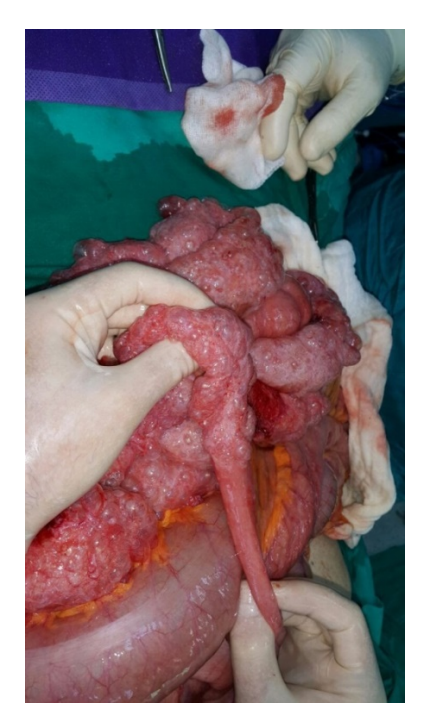
Figure 2. On the intestines cystic formations limited to the serosa were observed, affecting a 120 cm length of small intestine starting 1 meter after Treitz ligament.