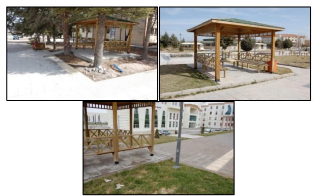
Figure 16. Top-covered applications have some deficiencies.

ramp usage. While it is possible to connect them with HYY, this is not applied in some areas (Figure 16).