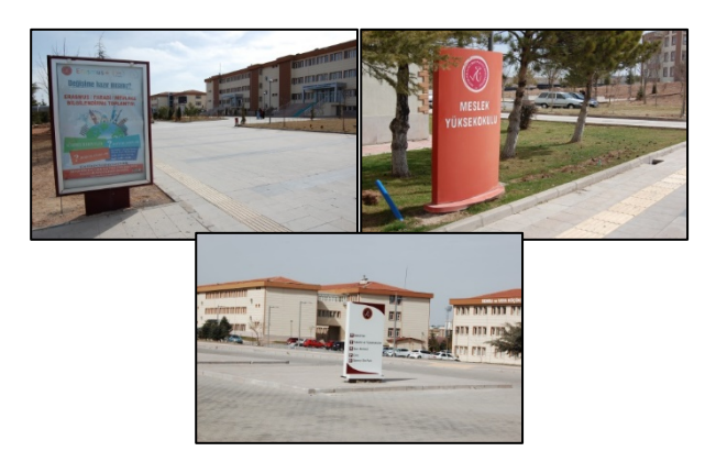
Figure 12. Board and panel applications.

Information boards pointing to faculty/college/institute, etc. are included. There is also an electronic billboard and advertising/ poster billboard in the area. These boards and panels are correctly applied in terms of height and position, they are designed easily for the perception of the user, and do not create any obstruction within the area and do not narrow the HYY and the road movement area. However, Braille surfaces were not used for visually impaired (Figure 12).