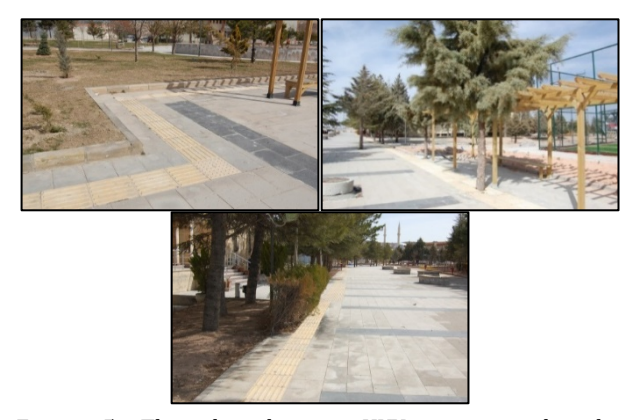
Figure 5. The obstacles on HYY routes make the application unsafe.

However, various mistakes were observed in practice. The distance between the borders of HYY is mostly 30 cm. This explains the dangers of the disabled person more or less; the walking path presented in a narrow area increases the likelihood of injury due to an accident with a small loss of balance. Moreover, it has been observed that many of the equipment and elements are directly or partly intersected in this way. For example, it is observed that while the garbage cans are located at the arm's edge, the bole of the present tree is in this way at one point. Or the branches of the bushes group can completely prevent walking. Apart from all the inconvenient conditions and effects, the disabled user is furthered by being pushed to the edge even when the appropriate area is available (Figure 5).