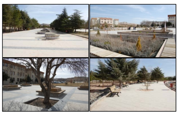
Figure 18. There are many seating units in the campus.

In accordance with the standard, the sitting benches have been used on the road sides, these elements do not make passing difficult, and do not narrow the road width and movement area. Moreover, seating units have also been used on the appropriate floor size and the passing is not obstructed in there, too. These units are designed without obstacles in terms of their qualities and size. There are chair spaces around the benches for people with disabilities to sit with their friends. No sharp or protruding pieces are seen (Figure 18).